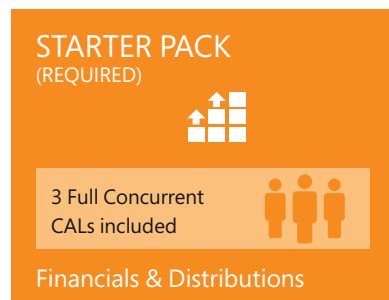
Figure 3: Starter Pack

For many businesses, this is the only license component required.