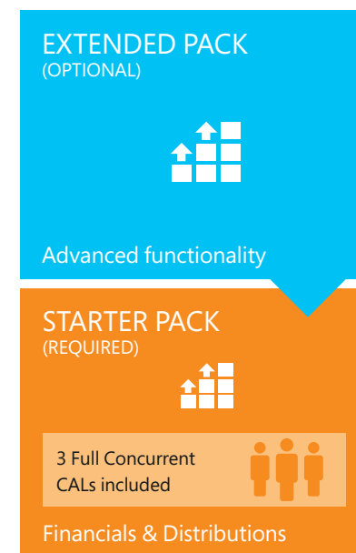
Figure 4: Extended Pack

The first three Full Users included in the Start Pack get to access to all of the incremental functionality.